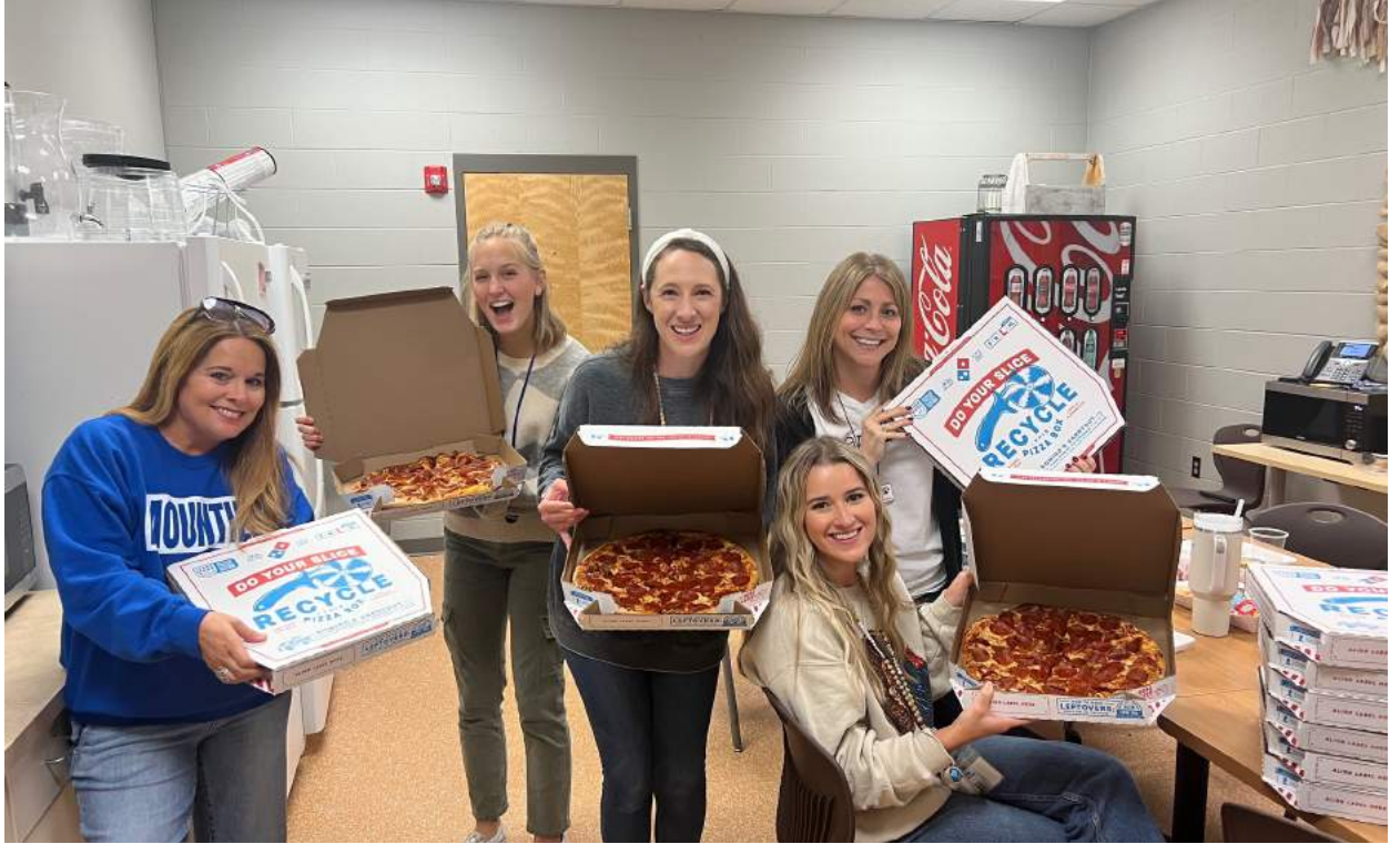
Teachers from Janie Darr Elementary School enjoyed pizza from RPEF

Any way you slice it, our teachers and staff are the best around! Thank you for all you do!