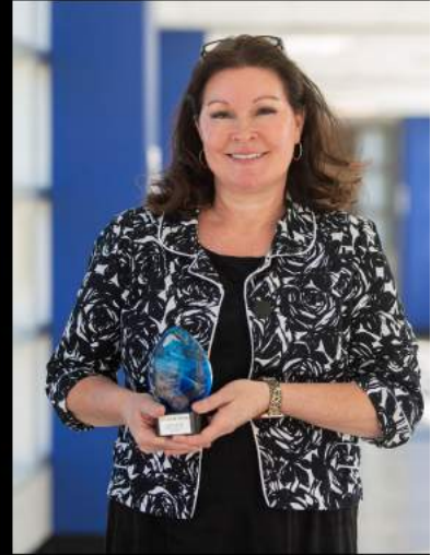
Laura Loyd Rogers High School