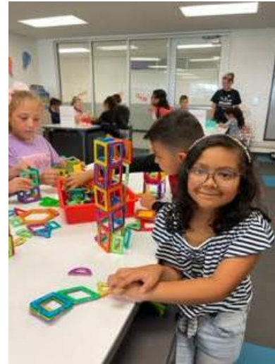
Rogers School District Students engaging in learning activities funded by RPEF Grants