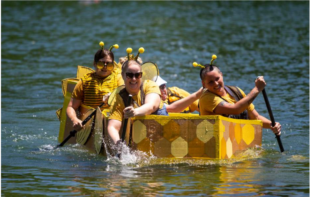
A hard-working team of bees rowing towards the finish line in the Ozark Beer Co. Cardboard Regatta