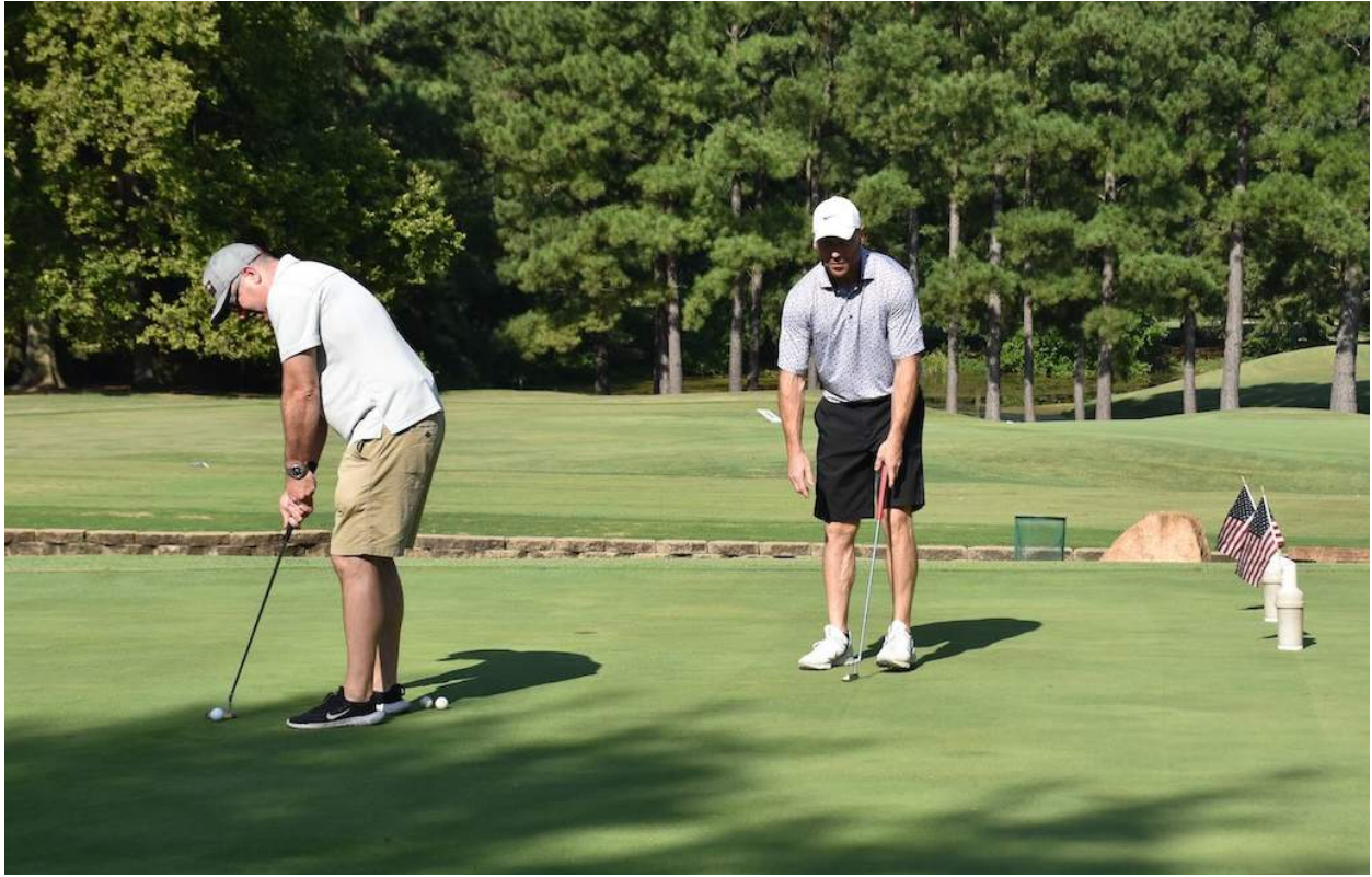
Competitors at the 2023 Tee Off Fore Teachers Golf Tournament trying to putt their way to a victory